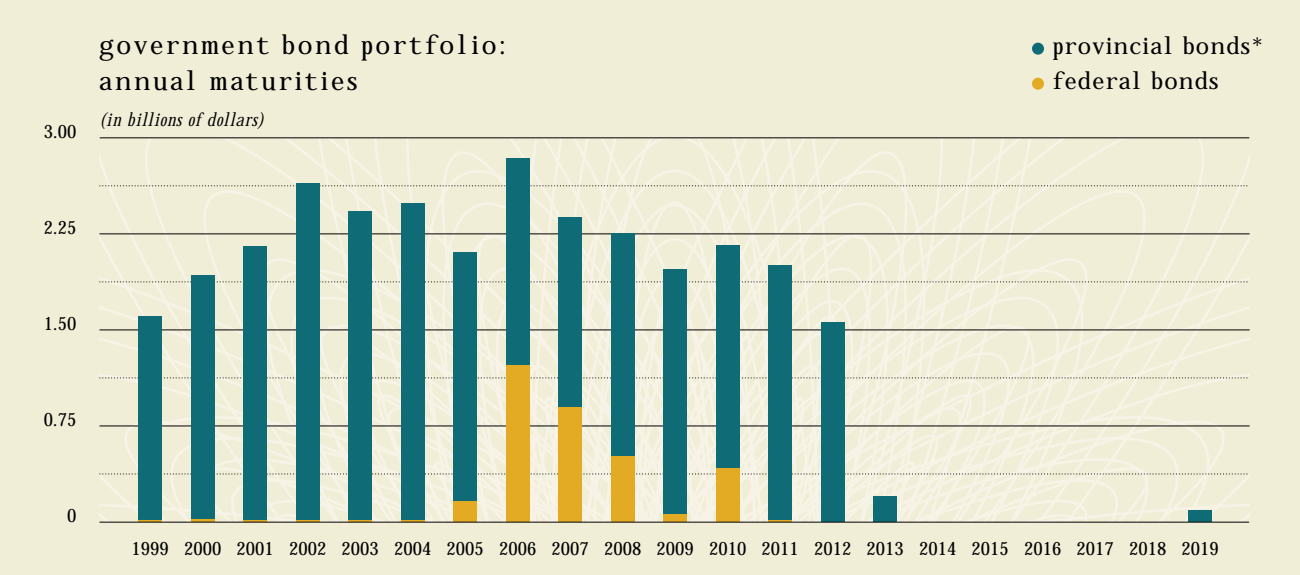
*Includes approximately $4 million of territorial bonds.

Between 1994 and 1998 no bond rollovers were permitted as the funds were required by the CPP. This accounts for the absence of maturing 20-year bonds from 2014 to 2018. The bonds maturing in 2019 reflect rollovers in the first three months of calendar 1999. There could be new maturities subsequent to 2019 if the provinces roll over bonds due between now and 2013.