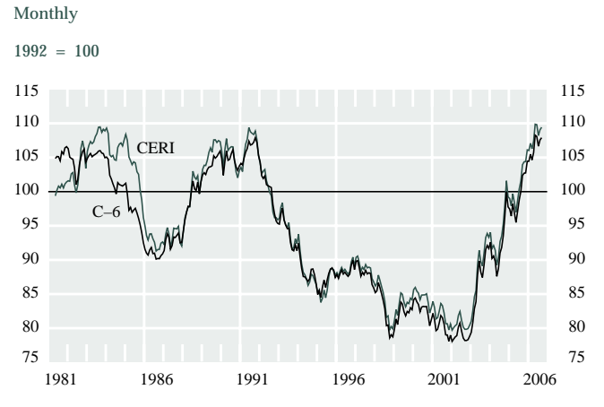
Chart 1 The CERI and the C-6

If the indexes are expressed in real terms, using the consumer price indexes (CPI) of the various countries, from 1981 to 1986 both the CERI and the C–6 were down by only 3.5 per cent (Chart 2). From 1986 to 1988, the real C–6 rose by 15 per cent, while the real CERI was up by 6 per cent. Since then, the two indexes have tracked each other quite closely.