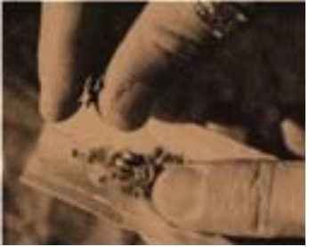
► Substance Abuse in Canada takes a critical look at a broad range of topics.