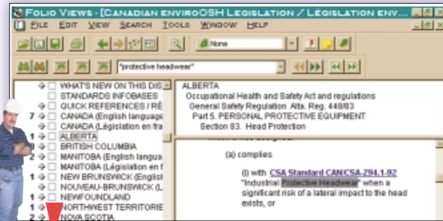
A sample record showing the results of a search for the phrase "protective headwear" and a referenced CSA standard.

The Canadian Centre for Occupational Health and Safety (CCOHS) is a national non-profit organization that collects, evaluates and distributes information on workplace health, safety and the environment from sources around the world. Recognized internationally as an innovative and expert resource, CCOHS is governed by a Council with representatives from employers, labour and government, and as such is committed to providing impartial and accurate information to all its clients. CCOHS represents Canada for the International Labour Organisation's CIS National Centre Program, and is a World Health Organization (WHO) Collaborating Centre.