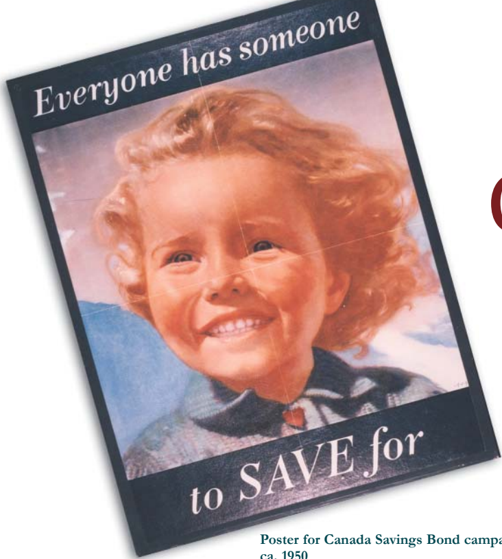
Poster for Canada Savings Bond campaign, ca. 1950

By mid-1950, the depreciation of the Canadian dollar against its U.S. counterpart the previous year, combined with rising commodity prices associated with the beginning of the Korean War in June 1950, had significantly strengthened Canada's trade balance with the United States. At the same time, the economic recovery in Europe, aided by the Marshall Plan, which provided European countries with convertible U.S. dollars, boosted Canadian exports (Muirhead 1999, 138). There were also strong inflows of direct investment into Canada. Short-term capital inflows also increased sharply, particularly through the third quarter of 1950, as speculation regarding a Canadian-dollar revaluation intensified.