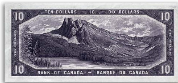
Bank of Canada, $10, 1954 series

This was the first note series to feature Canadian landscapes. These notes were simpler in design and more modern in style. This was also the only series to feature the reigning monarch on each denomination. This was popularly known as the “devil’s head” series because of the image discernible in the Queen’s hair.