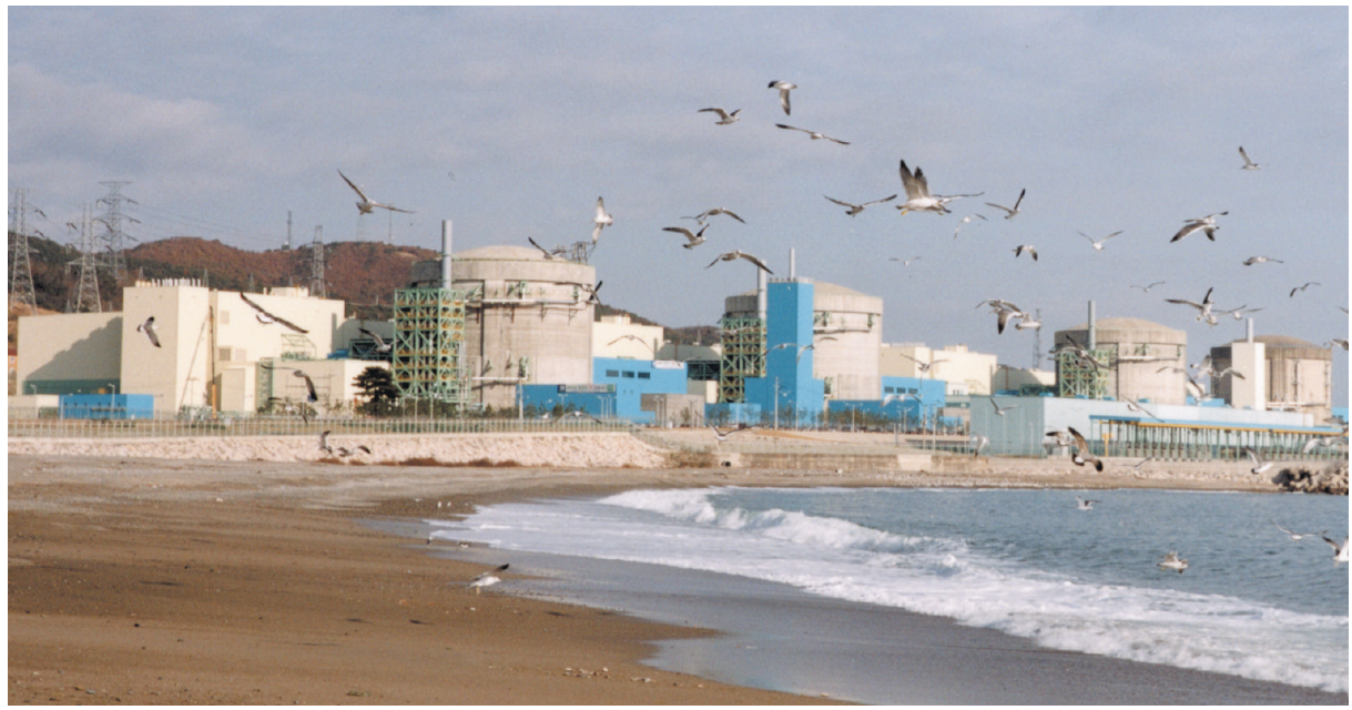
The four CANDU 6 reactors are world-top performers with a lifetime average of 85.4% for the year ending December 2000.

Source of all capacity factors is Nuclear Engineering International (NEI).