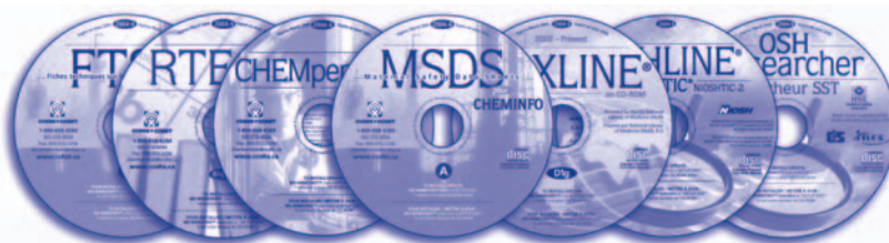
Watch for the new CD/DVD labels with the 2004-4 issue!

Note: DIS will replace CCINFOdisc in November. Subscribers will receive complete instructions and user tips on how to use the new service, however, as always, CCOHS Client Services are ready to help you and answer any questions you may have!