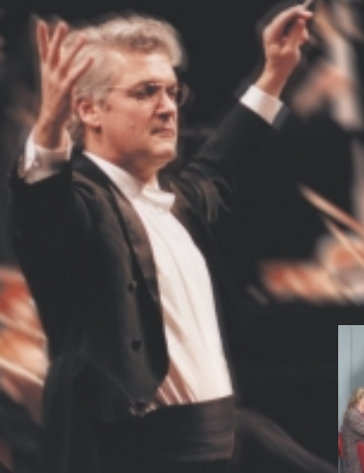
Pinchas Zukerman, Music Director of the National Arts Centre Orchestra

"It is a joy to hear him conduct and play with the conviction that has been admired in his recordings for decades" – The Ottawa Citizen