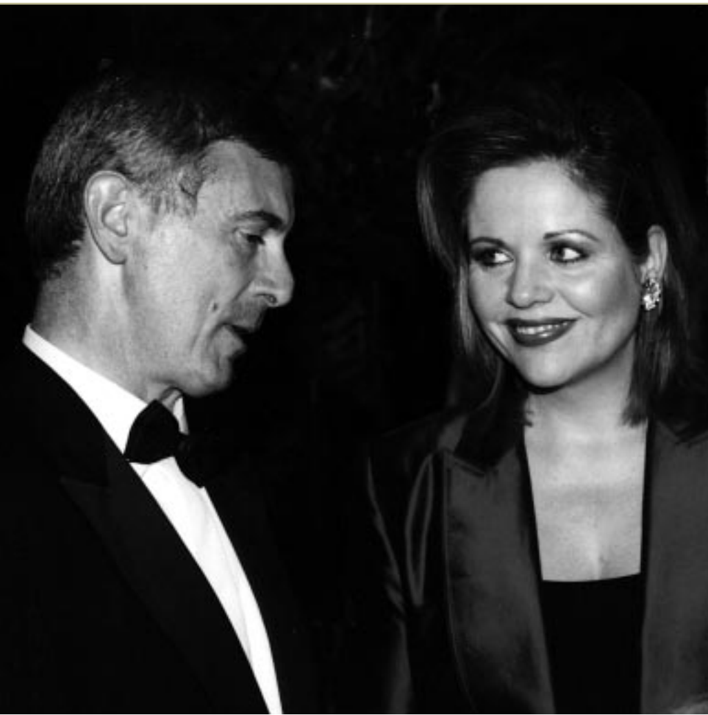
Renée Fleming with US Ambassador to Canada Paul Cellucci.