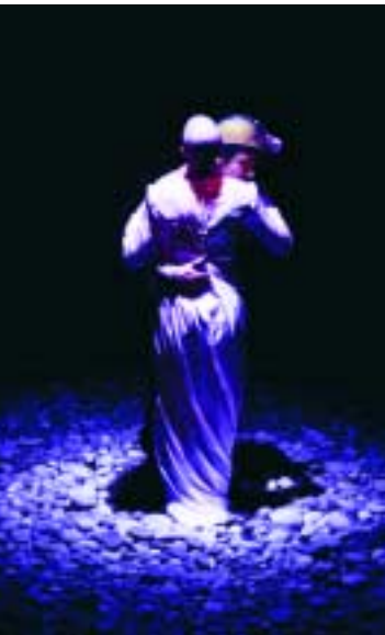
BURNING VISION