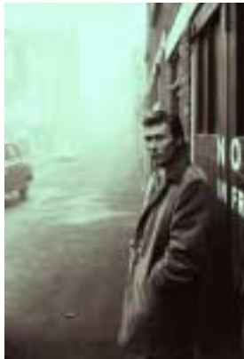
Photo of Henrik Ibsen, Photo of Samuel Beckett, Photo of John Osborne, 1958

SPECIAL SUMMER PRESENTATION BACK BY POPULAR DEMAND!