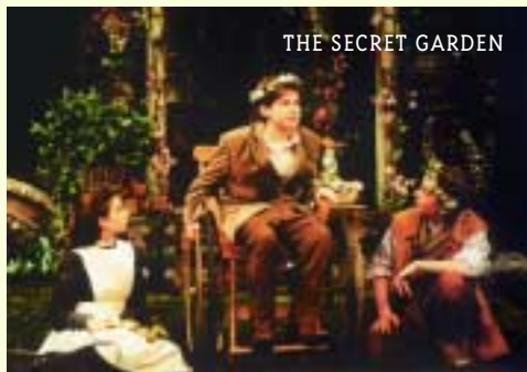
THE SECRET GARDEN