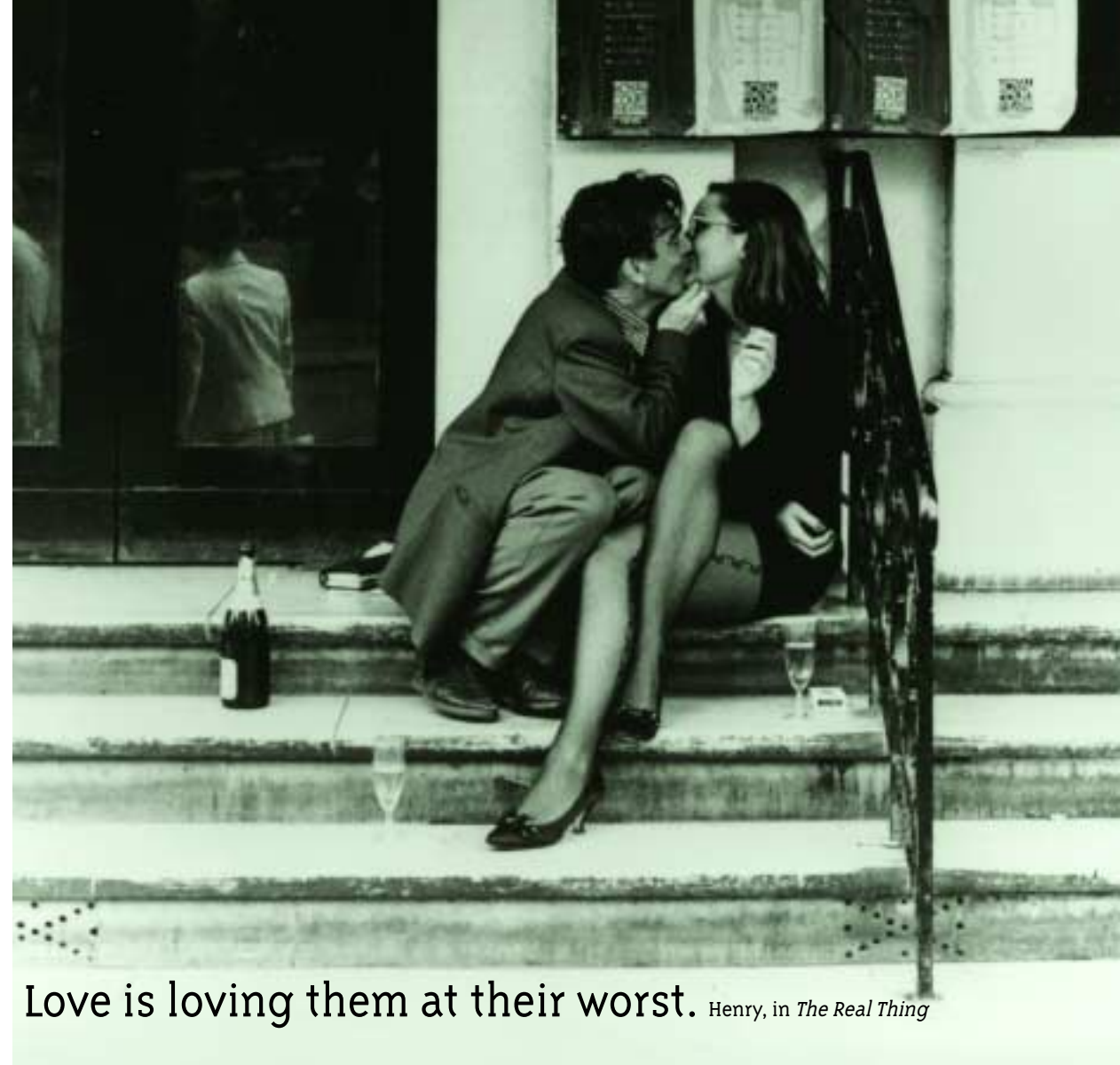
PHOTO: A couple on the steps of the Royal Court Theatre, London, 1988, by Dod Miller/The Observer/Getty Images.

It's no trick loving somebody at their best. Love is loving them at their worst. Henry, in The Real Thing