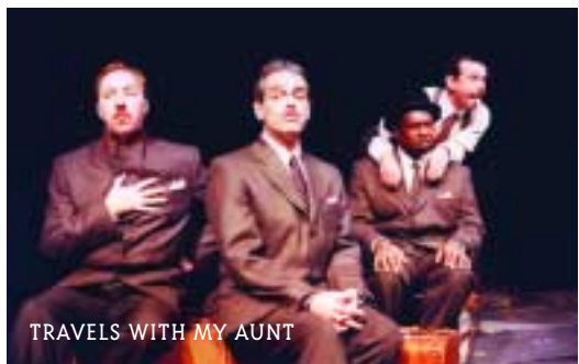
TRAVELS WITH MY AUNT