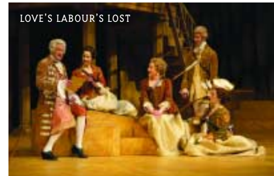
LOVE'S LABOUR'S LOST