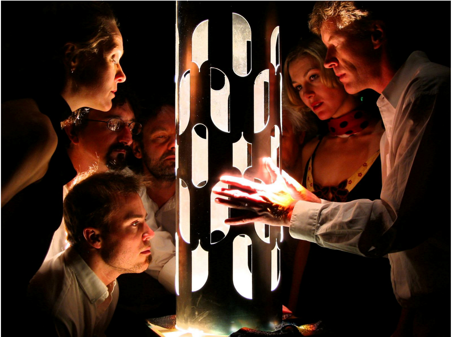
OYR's Dream Machine ensemble gathered around a Dream Machine