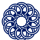
Table ronde nationale sur l'environnement et l'économie Édifice Canada, 344, rue Slater, bureau 200 Ottawa (Ontario) Canada K1R 7Y3

National Round Table on the Environment and the Economy Canada Building, 344 Slater Street, Suite 200 Ottawa, Ontario Canada K1R 7Y3