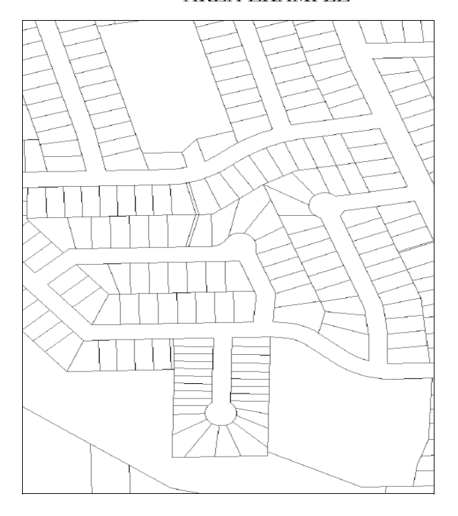
FIGURE 2 URBAN ENUMERATION AREA EXAMPLE