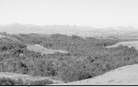
Photo: Oldman River