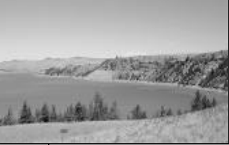
Prairie falcon nesting habitat