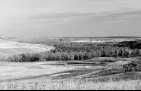
Photo: Riparian gallery forest