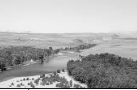
Photo: Oldman River