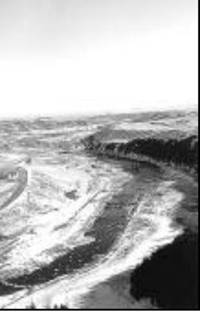
Photo: Boulder Run day use area