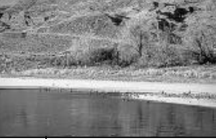
Photo: Oldman River at Lethbridge