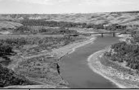
Photo: Oldman River downstream of Lethbridge