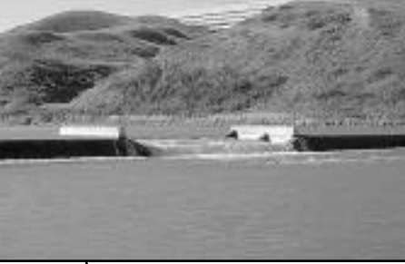
Photo: Fish Passage at Lethbridge