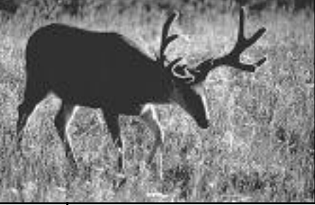
Photo: Mule Deer