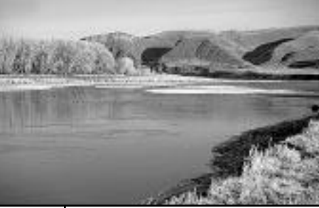
Photo: Oldman River at Lethbridge