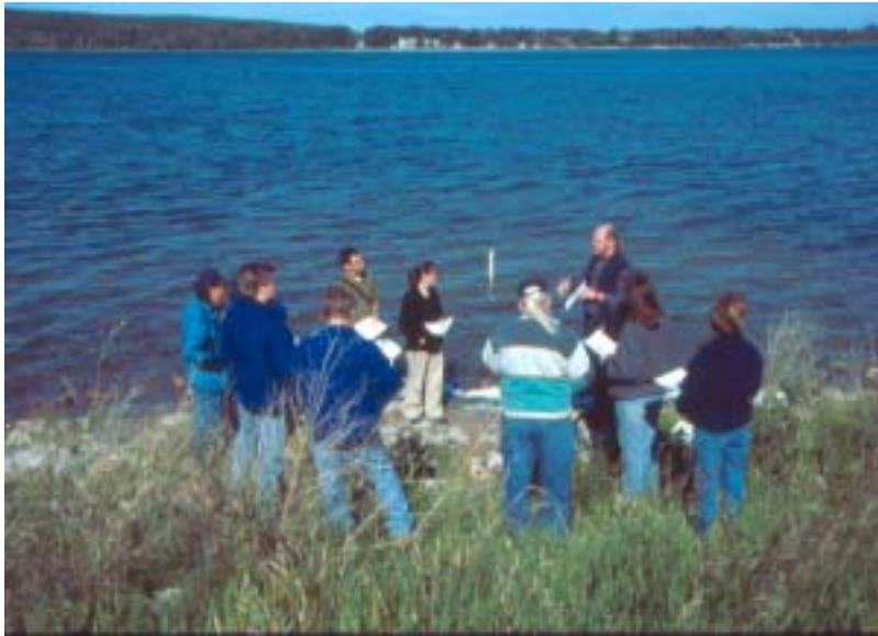
Cold Lake Basin Advisory Committee Tour June 25, 2003

The Basin Advisory Committee (BAC) is made up of representatives from local municipalities, LICA, and the local Métis and Aboriginal community. The BAC held its first meeting in June, and has since completed a tour of several portions of the study area. The BAC will work with