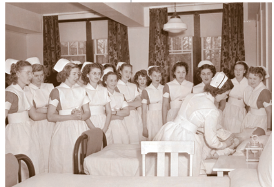
Provincial Archives of Alberta, PA2866/1 Panoka Mental Hospital, therapy lab - 1952

Increases in international travel coupled with new emerging pathogens, such as SARS (severe acute respiratory syndrome), means that constant preparation is needed to mitigate risk. Albertans can expect a more international perspective for the control of communicable diseases. It will be increasingly important to enhance linkages and communication networks within Alberta, across Canada, and internationally to prepare for and control disease outbreaks. Infectious agents know no borders and the rapid acquisition and dissemination of information for response and control is needed and will continue to be a priority into the future.