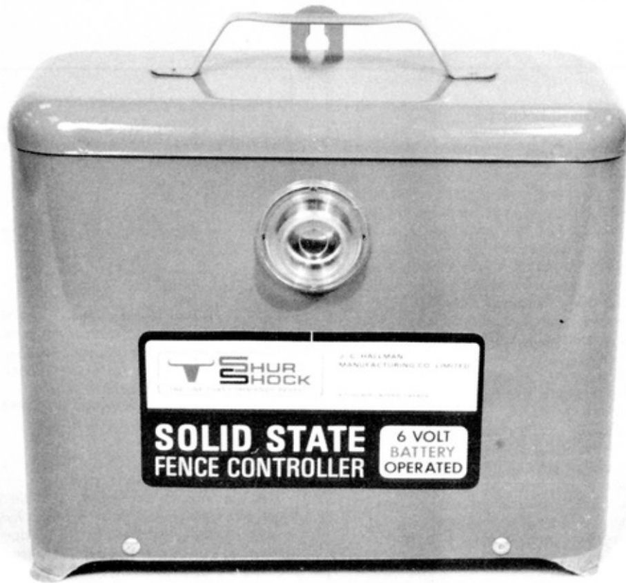
Shur Shock 6 Volt SS Fence Controller