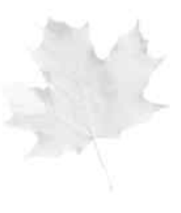
"Because we can only upgrade the IT as money becomes available, it's upgraded inconsistently. I don't know that there are any two people working on the same version of the same software."