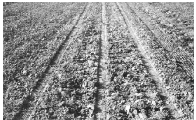
FIGURE 2. Jeannotte Tire Tracks Behind the Disker Seeder.

Seeding Depth Adjustment: Disker gang and frame levelling, and on-the-go depth cylinder adjustment were less critical and seldom required when the depth controllers were used. Without the Jeannotte Depth Controllers, these adjustments were more important and the operator had to frequently adjust the depth cylinders on-the-go to maintain a uniform seeding depth. Also, it was difficult for the operator to judge the tillage depth and make the necessary adjustment. This was especially true of a multiple disker hookup, since the depth cylinders of the last units could not be seen.