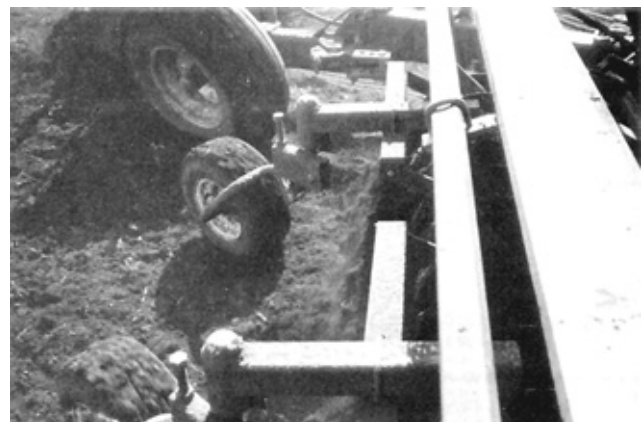
FIGURE 3. Operating in Wet Loam Soil.