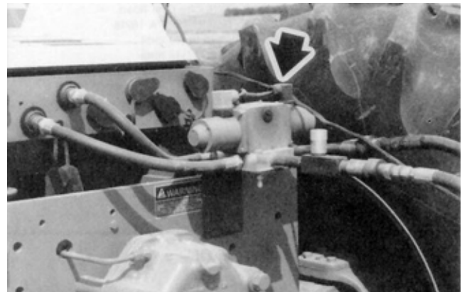
FIGURE 3. Electro-Hydraulic Solenoid Valve Mounted at Rear of Tractor.