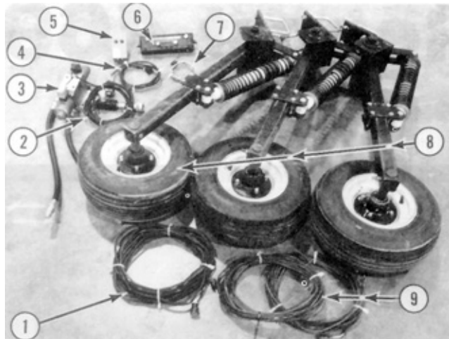
FIGURE 1. Microtek Automatic Depth Controller. (1) Main Sensor Cable, (2) Valve Cable, (3) Electro-Hydraulic Solenoid Valve (4) Main Control Cable, (5) Automatic Control Box, (6) Monitor Console, (7) Power Cable, (8) Gauge Wheels, (9) Wing Cables.

$3,500.00 (January, 1986, f.o.b. Lethbridge, Alberta)