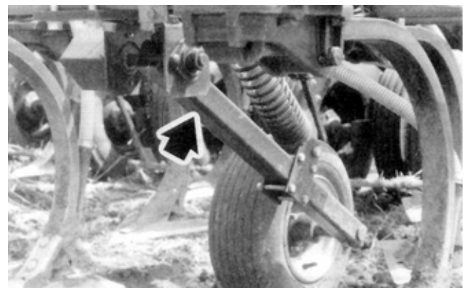
FIGURE 4. Microtek Gauge Wheel Mounted on Cultivator Frame.