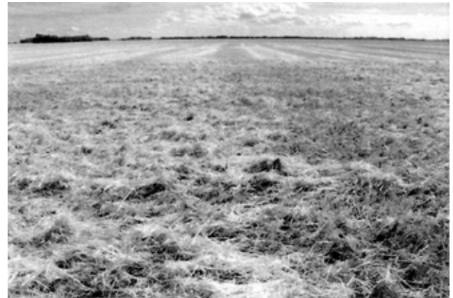
FIGURE 3. Straw Spread (After Two Passes).

In wheat stubble, when set at the 45° harrow angle, chopped straw left by the combine was moved about 3 ft (0.9 m) when operated perpendicular to the direction of the previous combine operation. Harrowing the field a second time in the same direction moved the straw approximately another 4 ft (1.2 m) (FIGURE 3). In extremely heavy trash conditions, the trash was left evenly on the field surface after one pass. However, a second pass resulted in small straw bunches on the field surface (FIGURE 4).