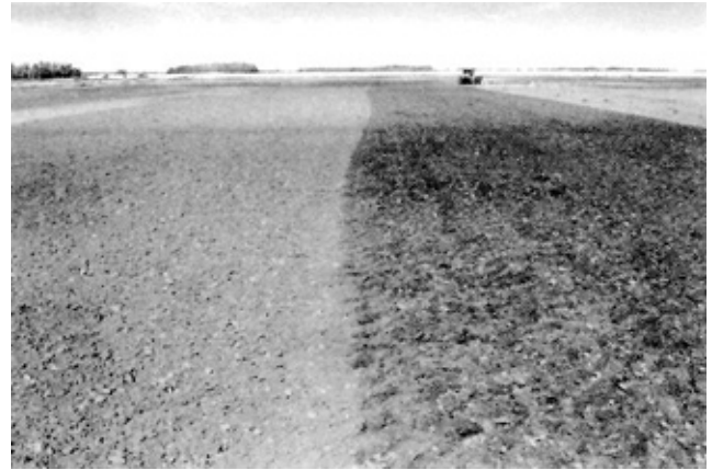
FIGURE 2. Field Surface in Summerfallow.

The Phoenix rotary harrow was capable of shallow incorporation in both summerfallow or stubble conditions. The best incorporation in summerfallow or stubble occurred at the 45° harrow angle. One pass with the rotary harrow covered approximately 90% of the chemical. However, to ensure better mixing of the chemical in the soil, a second pass at an angle to the previous pass is recommended.