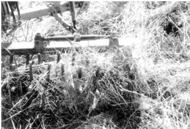
FIGURE 5. Tough Material Wrapped at Bearings.

Green weeds and tough straw wrapped tightly at the three trailing tine bearing locations (FIGURE 5). The wrapped material required frequent removal in weedy or tough straw conditions. It is recommended that the manufacturer consider modifications to the tine bearing mounts to prevent wrapping of tough material.