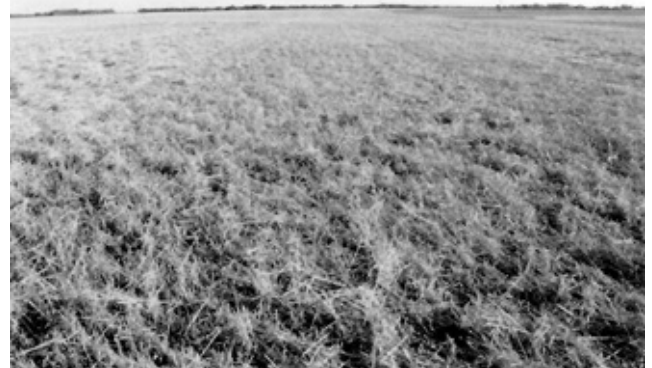
FIGURE 4. Hail Damaged Wheat (Second Pass).