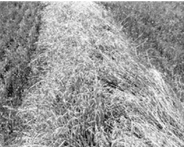
FIGURE 4. Wheat, Yield: 2.5 t/ha (40 bu/ac).