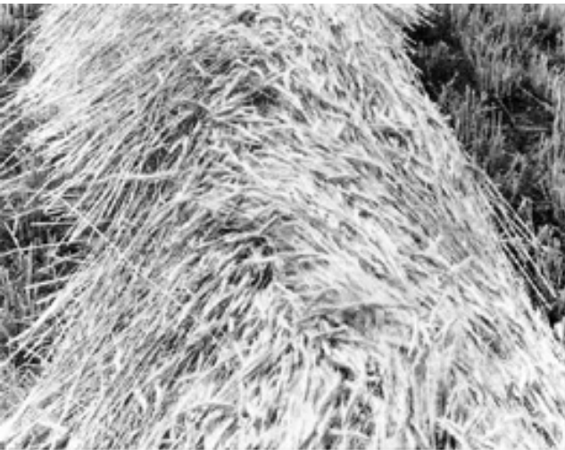
FIGURE 5. Wheat, Yield: 2.4 t/ha (35 bu/ac).