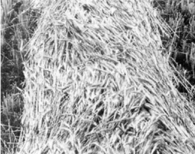
FIGURE 3. Rye Yield: 2.5 t/ha (40 bu/ac).