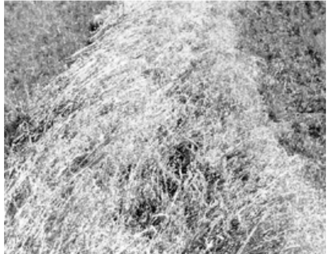
FIGURE 6. Oats, Yield: 2.1 t/ha (60 bu/ac).