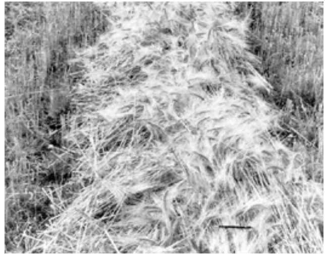
FIGURE 7. Barley, Yield: 2.1 t/ha (40 bu/ac).