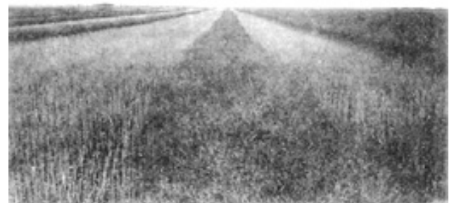
FIGURE 3. Uniform Rapeseed Windrow Obtained with the Fuma Sabre.