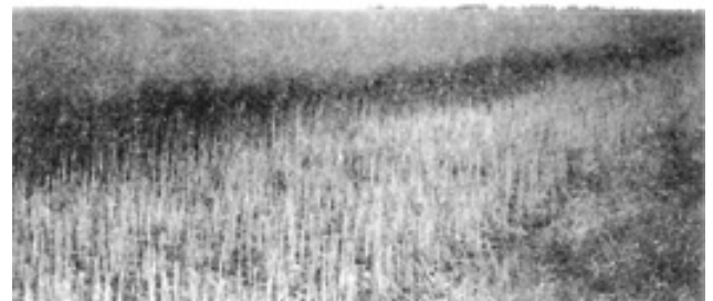
FIGURE 2. Crop Edge left by the Fuma Sabre in Rapeseed.

In the cereal crops, the powered divider cut well and left a clean crop edge. However, in leaning cereal crops, the powered divider had to be removed because some heads were being cut off and lost on the ground. In straight cereal crops, the Fuma Sabre was not needed.