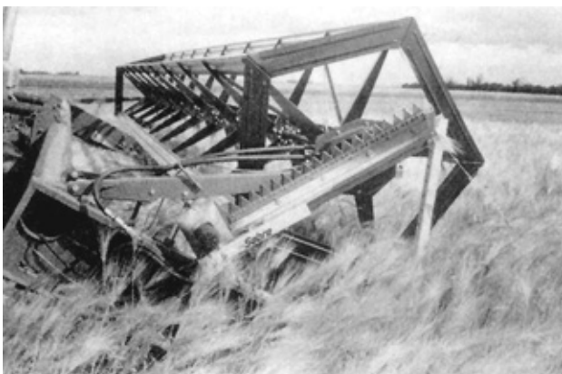
FIGURE 4. Fuma Sabre Stored for Use in Cereal Crops.

The Fuma Sabre drive components were adequately shielded. A warning decal was affixed to warn of potential danger from the moving cutterbar. Caution must be exercised when working around powered crop dividers.