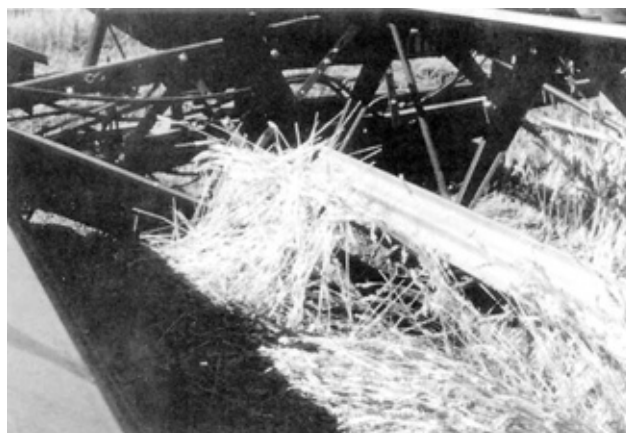
FIGURE 3. Typical Crop Delivery Off the Pan.

Grain heads from the Stripper II were placed on the left side of the windrow primarily on top of the long-strawed windrow material. Normal draper speeds of 400 to 600 fpm (2 to 3 m/s) on the windrower were satisfactory. About 8 to 12 in (200 to 300 mm) of straw was left with the grain heads to keep them from falling through the stubble. The windrows were easily picked up by the combines with no noticeable increase in picking loss.