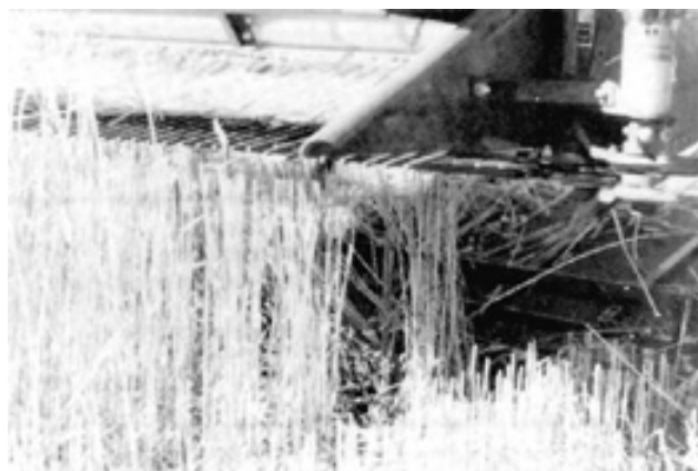
FIGURE 2. Typical Cutting Height.

The opposed action knives had adequate power, stalling only in heavy patches of Canada thistle. Stalling could usually be avoided by slowing down through weedy patches. Increasing cutterbar speed also provided more power, but the manufacturer warned against excess speed as it may accelerate wear on the knives and hydraulic motor. A speed of roughly 600 rpm was suitable for normal crops.