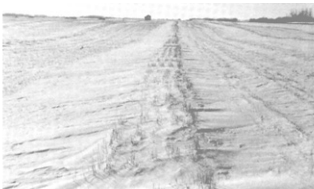
FIGURE 5. Barrier Strips in Katepwa Wheat Stubble with 30 ft (91 m) Spacing.

Snow catch was not recorded during the PAMI evaluation. FIGURE 5 illustrates typical snow catch from the Stripper II when mounted on a 30 ft Westward 3000 pull-type windrower.