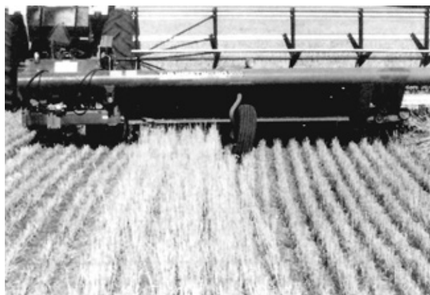
FIGURE 4. Barrier Strip Formation and Position.

The Stripper II produced rectangular tall stubble strips on the left end of each windrow pass (FIGURE 4). Barrier height depended on reel adjustment and crop height, but was generally 8 to 12 in (200 to 300 mm) less than full crop height.