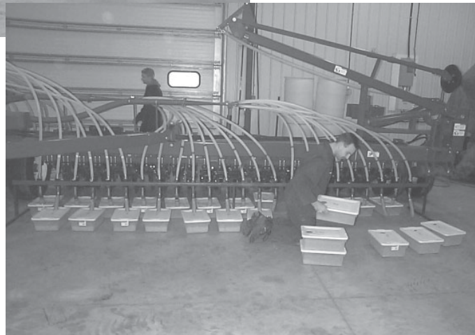
Collecting the test results.