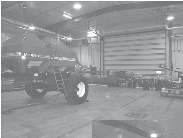
Setting up the test.