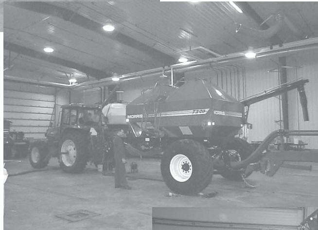
Setting mph and rpm.