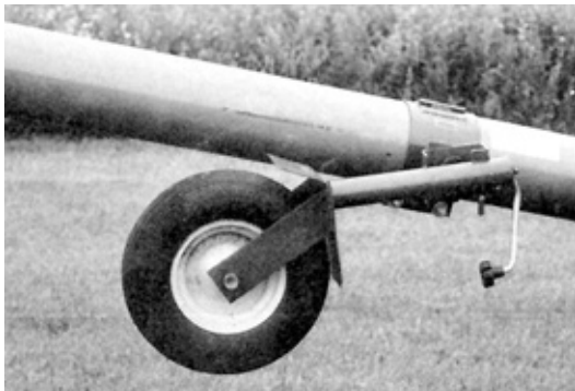
FIGURE 2. Transport position.

Transporting: Installing the Easy Auger Mover on the grain auger, did not affect the transporting characteristics of the auger. The caster wheel was easily raised into transport position (FIGURE 2) or removed and placed into the tow vehicle along with the handle.