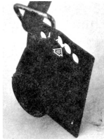
FIGURE 3. Angle adjustment failure.

The only durability problem that occurred with the Easy Auger Mover during the test, was failure of the angle adjustment (FIGURE 3). It is recommended that the manufacturer modify this adjustment to improve its strength and durability.