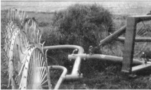
FIGURE 5. Crop Bailing Up and Rolling in Front of the Finger Wheels.

Ease of Adjustment: The Vicon H1240 Trapeze V-Rake required adjustment to suit the mass of the windrows. For example, the discharge end of the "V" had to be opened up to allow large heavy swaths to be raked without creating large bunches of hay to ball and roll in front of the rear finger wheels (FIGURE 5). In light swaths, the opening had to be reduced so that the windrows would be combined into one, rather than laying two light swaths side by side.