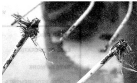
FIGURE 2. Soil Sticking to Tips of Fingerwheel Tynes.

Quality of Work: The Vicon H1240 V-Rake, was effective in raking two windrows together. The rake was also used to turn single windrows of barley to expedite drying. Curing time was significantly reduced, as a result of raking, both in hay crops and cereals. Leaf loss in alfalfa was negligible, however, some crop was lost when the Vicon was operated with too much pressure on the finger wheels in damp soil conditions (FIGURE 2). Soil sticking to the tips of the fingers caused hay to be carried around the rear finger wheel and dropped over the backside where it could not be retrieved (FIGURE 3). It is recommended that modifications be made to prevent soil sticking to the fingers.