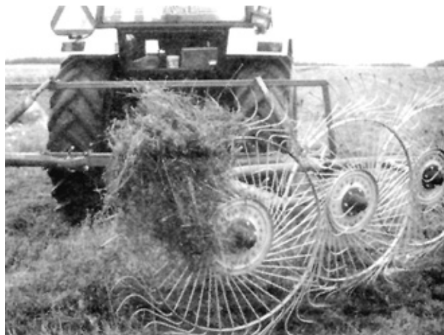
FIGURE 4. Windblown Crop Falling Behind Finger Wheels.

In large, light and fluffy swaths such as fall rye, the Vicon performed well when raking into the wind, but travelling cross-wind and downwind caused crop to blow back against the fingerwheels and leave large clumps (FIGURE 4).