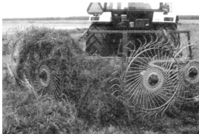
FIGURE 3. Crop Carried Over Top of Fingerwheel.

Making a 90° turn caused the fingerwheel gang on the inside of the turn to stop rotating, leaving clumps of hay at the corners. This problem could be eliminated by raking the corners first. Starting at outside corners and moving on a diagonal towards the centre of the field, also allows easier baler access. Some sideways skewing was experienced, resulting in crooked windrows. It is recommended that the manufacturer make modifications to reduce side skewing.