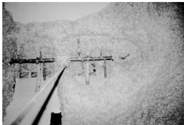
Flexi-coil 1720 Agitator