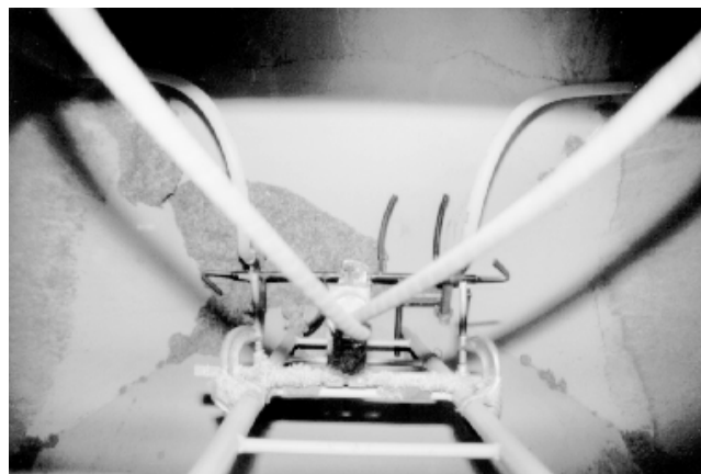
Morris 6130 Agitator