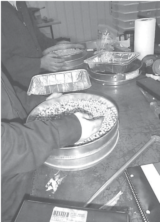
Sorting seeds for damage.