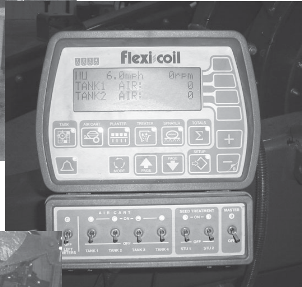
The Flexi-Coil air seeder monitor.