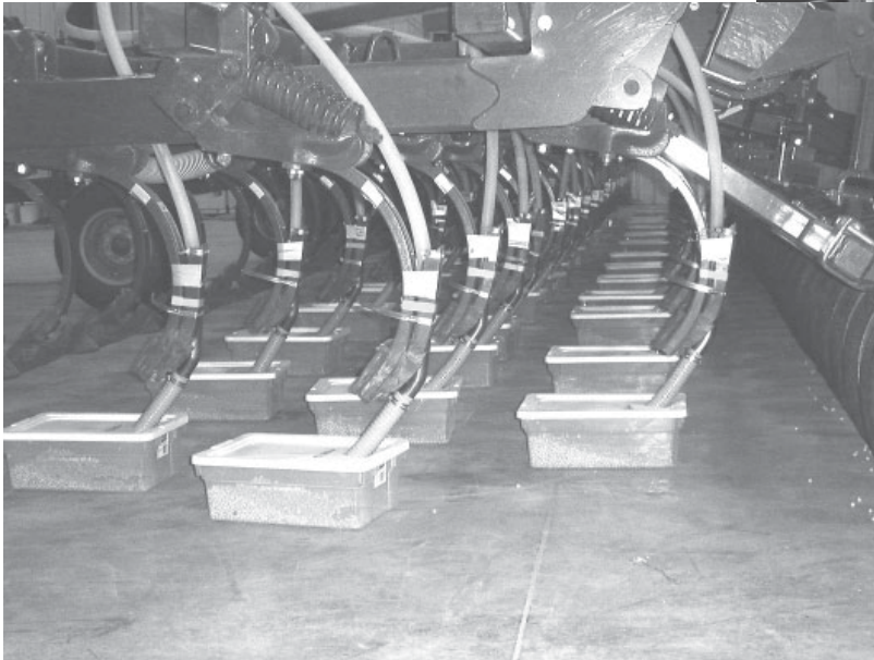
The collection tubs.