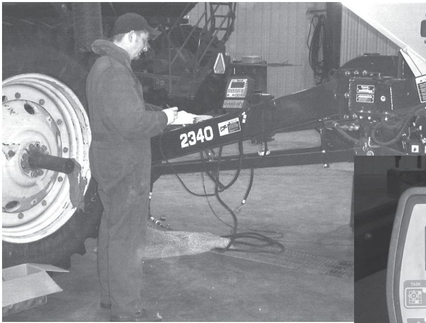
Checking mph and rpm.