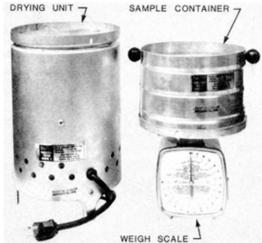
FIGURE 1. Koster Forage Moisture Tester.

RETAIL PRICE: $200.00 (June 1981, f.o.b. Cleveland, Ohio, U.S.A.)