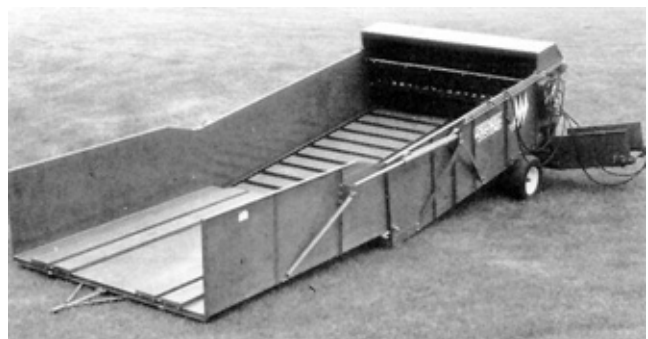
FIGURE 2. Transport Position.

The manufacturer recommended that the deck be emptied of all material and that a suitable safety chain be attached. A pick-up truck, with minimum gross vehicle weight of 7500 lbs (3400 kg), was required to transport the Greenbelt due to a hitch weight of 1370 lbs (686 kg).