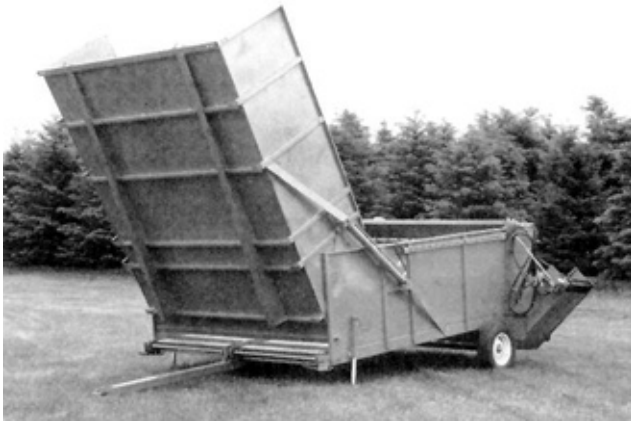
FIGURE 2. Transport Position.

During transport, the drawpole was permanently bent at the clevis hitch. It is recommended that the manufacturer modify the hitch and drawpole to prevent bending.