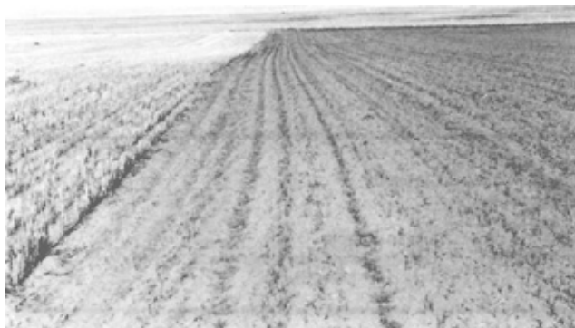
FIGURE 3. Wheat Emergence on Summerfallow.