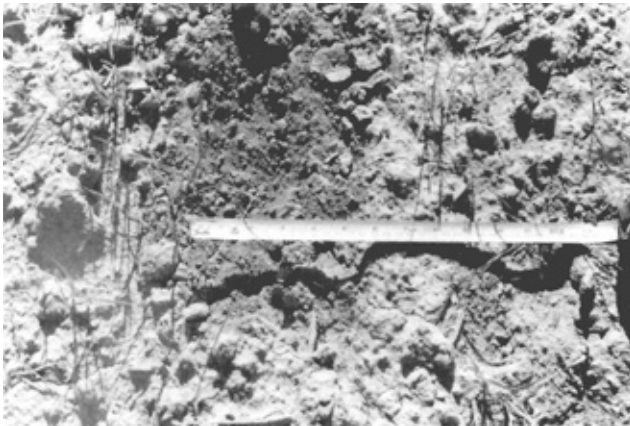
FIGURE 2. Typical Row Spacing.

Distinct rows with wide spaces between them (FIGURE 3) may not provide sufficient stubble for windrow support at harvest time. This may require seeding and swathing at angles to each other, or going to a cultivator with a narrower shank spacing.