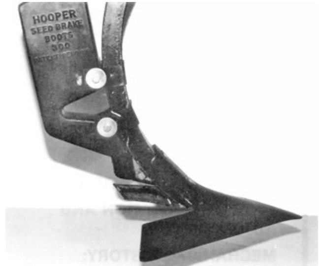
FIGURE 4. Hooper Seed Brake Boot Mounted on Cultivator Shank.

The Hooper Seed Brake Boot was mounted in place of the conventional seed boot on a heavy duty cultivator. The seed brake was installed on the back of the cultivator shank so that the spout was even with the top plow bolt. A V-shaped deflector can be mounted below the spout (FIGURE 4) to assist in spreading the seed.