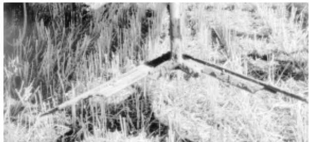
Haybuster Wide Blade sweep

All of the soil above the blade was lifted and then settled as the blade passed. This feature retains surface residue, and is ideal as a means of residue retention with tillage. However, direct seeding systems depend on reduced soil disturbance as a means of preventing weed germination and improving water infiltration rates. For these reasons the