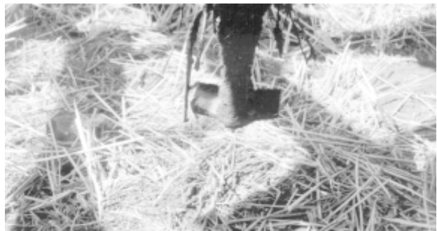
Harvest Technologies hollow wing

Injection efficiency was excellent in all cases with no liquid pooling and only minimal, if any, liquid visible in the furrow. However, the degree of soil surface disturbance ranged from 75% to 100%, depending primarily on speed of travel. This is considered too high for LDS.