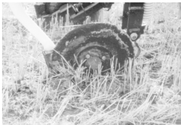
Bourgault mid-row bander

Soil disturbance rated from good to fair (42-75%) depending on ground speed. Residue retention was good, leaving enough standing stubble for good snow trapping.