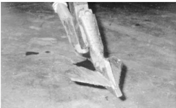
Inverted "T" opener

While the injection efficiency was excellent at 9,000 GPA (100,800 l/ha), good at 12,000 (134,400) and fair at 24,000 (269,500), soil surface disturbance ranged from 75%, 67% and 58% respectively as a function of travel speed. Because of the amount of soil disturbance, further testing was not conducted.