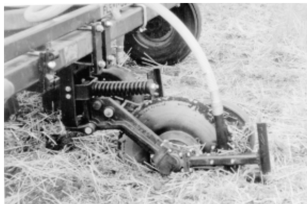
Yetter Avenger manure injector

Residue retention was good with sufficient stubble standing for good snow trapping.