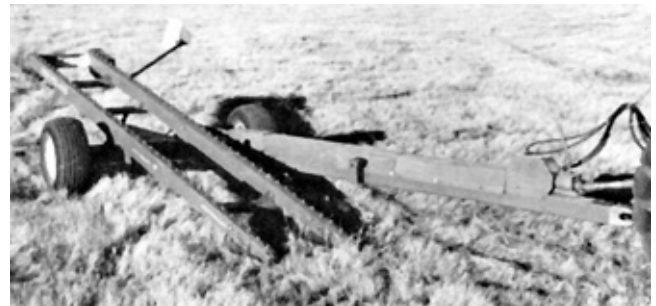
Figure 2. New Holland 85 in Loading Position.