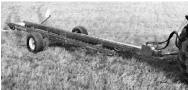
Figure 1. New Holland 85 in Transport Position.

$4497.00 (June, 1977, f.o.b. Humboldt, complete with all hydraulic cylinders and hoses).