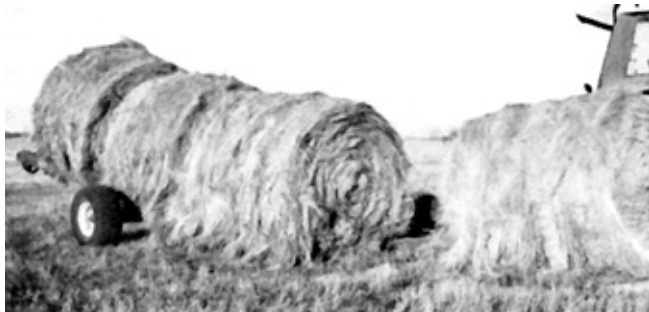
Figure 3. Approaching the Fourth Bale.

The transfer chains and drive line are protected from overload with a shearbolt. The shearbolt will fail under surge load if the power take-off is rapidly engaged.