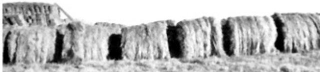
Figure 6. Bales Uniformly Spaced in a Row.

Depending on operator preference, any row spacing could be obtained. With experience an operator could place rows tightly together (Figure 7).