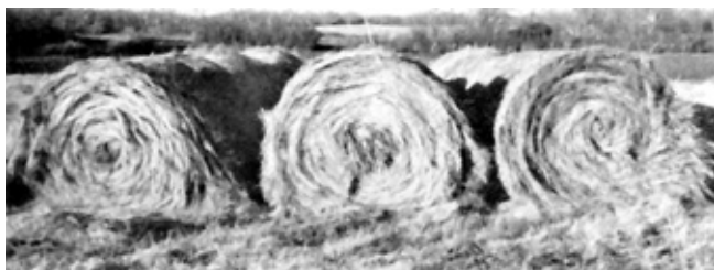
Figure 7. Rows of Bales Placed Closely Together.