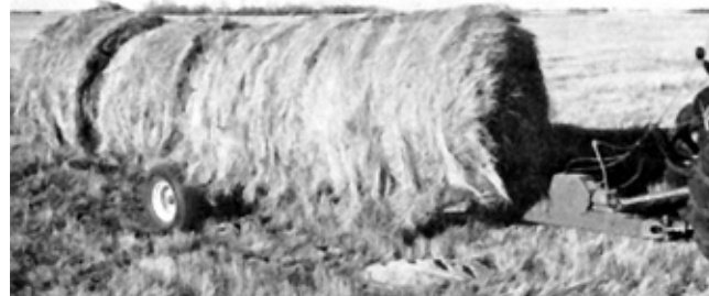
Figure 5. New Holland 85 Fully Loaded in Transport Position.

For travel on public roadways the tongue should also be locked in transport position by inserting the tongue retaining pin at the tongue hinge.