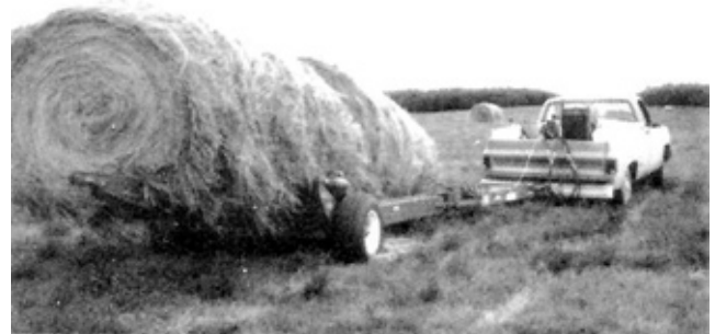
Figure 5. Operating the Hesston 5200 With a Truck.

The Hesston 5200 loaded on the left side of the tractor. This meant that the operator faced left away from the tractor hydraulic controls, although this did not seriously hinder operator performance. Left side loading meant that the mover could be used with a truck (Figure 5) equipped with hydraulic system, as the driver had visibility for loading. This could be advantageous for long distance hauling although at least a one-ton truck with special equipment would be required.