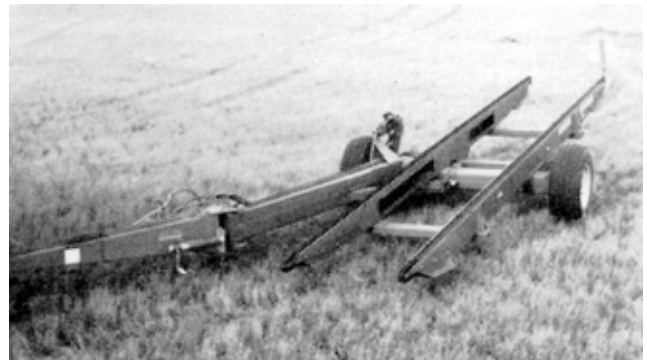
Figure 2. Hesston 5200 in Loading Position.