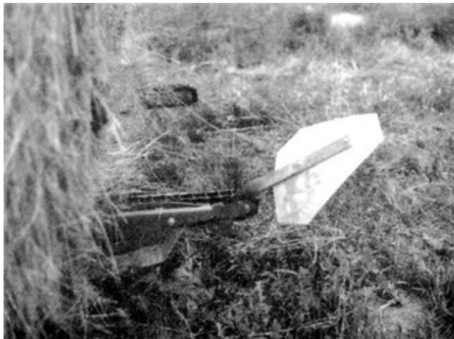
Figure 8. Bent SMV Sign Bracket.