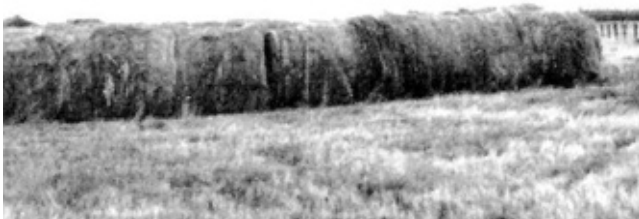
Figure 9. Individual Bales Butted Tightly Together.

Placement: After removal of the bed and tongue lock pins and the SMV sign, the mover is ready for unloading. With the rails tilted rearward the rail chains are engaged as the tractor advances in low gear. This method was very successfully used to set tight rows (Figure 9) It was found easiest to align rows by leaving the mover in transport position when unloading from the rear.