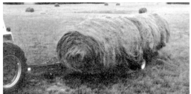
Figure 6. Mover Fully Loaded With Bed Levelled.

Transporting: When fully loaded, the bed is raised (Figure 6) and the tongue is hydraulically swung into transport position (Figure 7). For travel on public roadways the tongue swing lock pin and bed tilt lock pin should be installed. The SMV sign must also be inserted into a bracket at the rear of the left rail. If the load was long and there was bale overhang, the sign could not be inserted. All overhang had to be at the front of the rails to permit sign insertion. The load also could not be moved rearward without bending the sign bracket (Figure 8) if it was not removed before unloading. It was necessary for the operator to decide if the overhang over the front was excessive for safe transit on public roads. A permanently installed SMV sign should be attached at the rear of the mover to eliminate this problem.