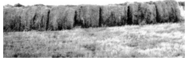
Figure 10. Bales Uniformly Spaced In a Row.