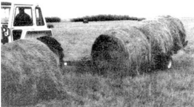
Figure 4. Approaching the Fourth Bale.

Operator experience was required before bales could be loaded non-stop. Starting and stopping the rail chains at the correct time was critical. Starting them too soon or stopping them too late left gaps between bales resulting in room for only three bales on the bed. Starting the chains late caused the oncoming bale to skid on the ground and could damage the twines at the bottom of the bale resulting in lost tension. Skidding was sometimes necessary before the chains would grasp a bale. More aggressive rail chains would be desirable.