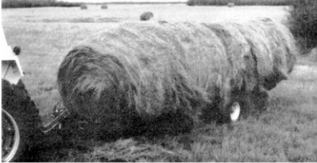
Figure 7. Moves Fully Loaded in Transport.