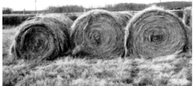
Figure 11. Rows of Bales Placed Closely Together.

The Hesston 5200 towed well in both smooth or rough fields and trailed well on roadways at speeds up to 29 km/h (18 mph). Side clearance was ample for narrow roadways as in transport position the mover trailed directly behind the tractor. Loss during transport was insignificant, even with ragged or untied bales.