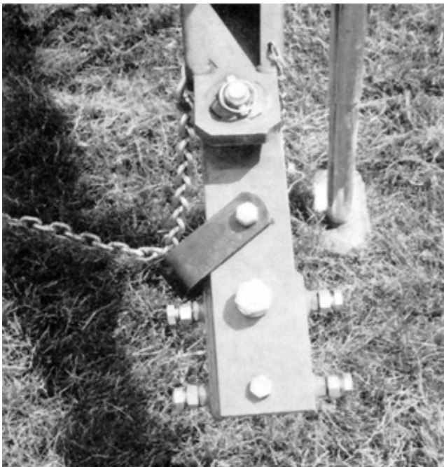
FIGURE 3. Hitch Extension.

The PTO driven hydraulic pump was placed on the greased powershaft of the tractor, and its anti-torque lever was adjusted to bear against the drawbar and was chained in position. On some makes of tractors the drawbar roller interfered with the hydraulic pump and required time consuming relocation. It is recommended that the manufacturer consider an addition to the operator's manual that would list and outline potential hitching problems with some tractors. Hookup was completed with the attachment of four hydraulic hoses to the remote hydraulic couplers of the tractor and proper attachment of the safety chain.