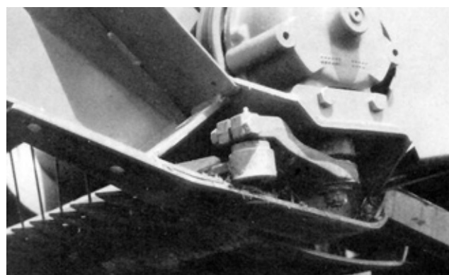
FIGURE 5. Wobble Box Assembly.