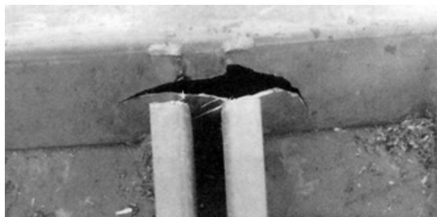
FIGURE 4. Broken Header Tilt Bracket.

Drive Belt: At 115 hours the wobble box drive belt failed. The belt was replaced and no further problem occurred.