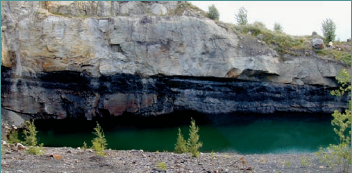
The Whiskey Lake open-pit coal mine in operation in the early 1990s (top) and later view of the upper coal seam (bottom).