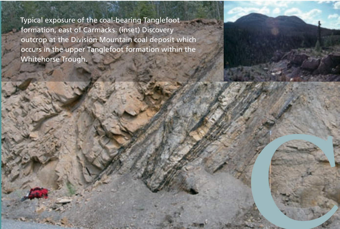
Typical exposure of the coal-bearing Tanglefoot formation, east of Carmacks. (inset) Discovery outcrop at the Division Mountain coal deposit which occurs in the upper Tanglefoot formation within the Whitehorse Trough.