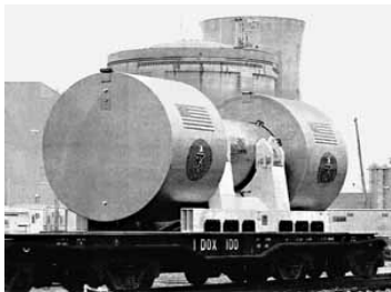
High-level nuclear waste casks could be on our roads and rails if we don't stop the Yucca Mountain and Skull Valley nuclear waste projects