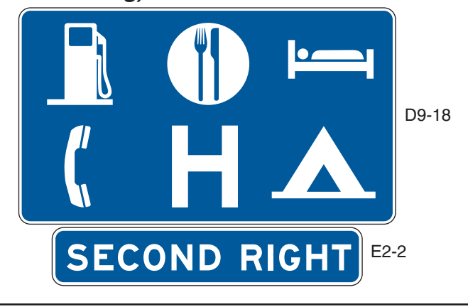
Figure 2E-42. Examples of General Service Signs (with Exit Numbering)

55 55 EXIT EXIT FOOD - PHONE GAS-LODGING D9-18a D9-18 HOSPITAL CAMPING 1/2 MILE E2-3 OR OR 38 38 EXIT EXIT FOOD - PHONE GAS-LODGING Rev. 1 D9-18 D9-18a HOSPITAL PHARMACY 1/2 MILE