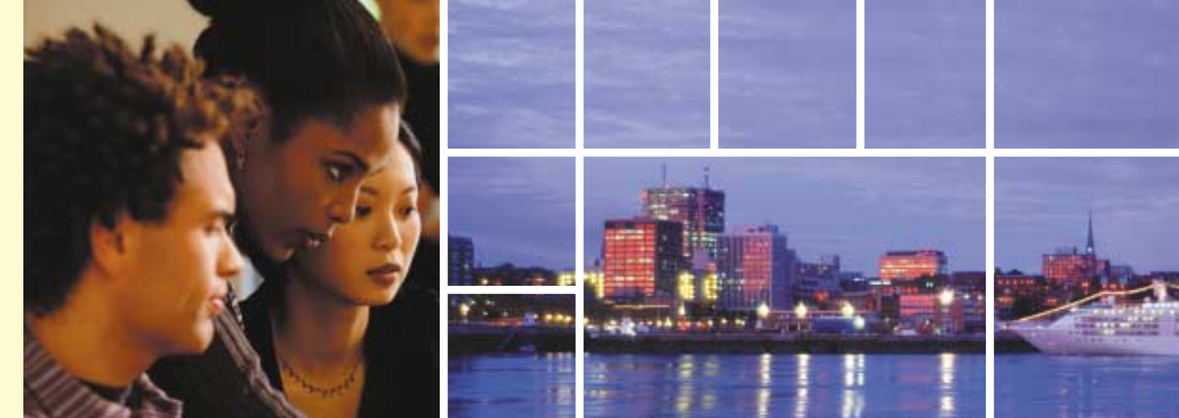
Exhibit Designer, Germany

THE PERFECT PLACE TO START A BUSINESS, RAISE A FAMILY, AND ENJOY LIFE.