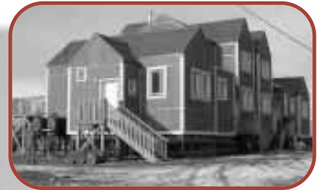
New housing going up in Arviat.

The arrangement has also been recognized as a success story by the Canadian Council for Public-Private Partnerships. In November 1999, NCC and DIAND received an Award of Merit in Infrastructure, which described the construction project as standing out among "innovative development partnerships." *