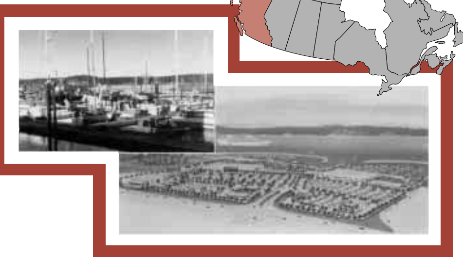
The First Nation's marina (l.), and (r.) artist's overview of Discovery Harbour Centre.

Employment opportunities for First Nation members have been a priority since the project began. An employment placement officer was hired at the outset, to identify the types of qualifications that would be required. Community members then got training in several areas, including cashier services, security, and industrial first aid. As a result, First Nation members have benefited from nearly 1,000 new