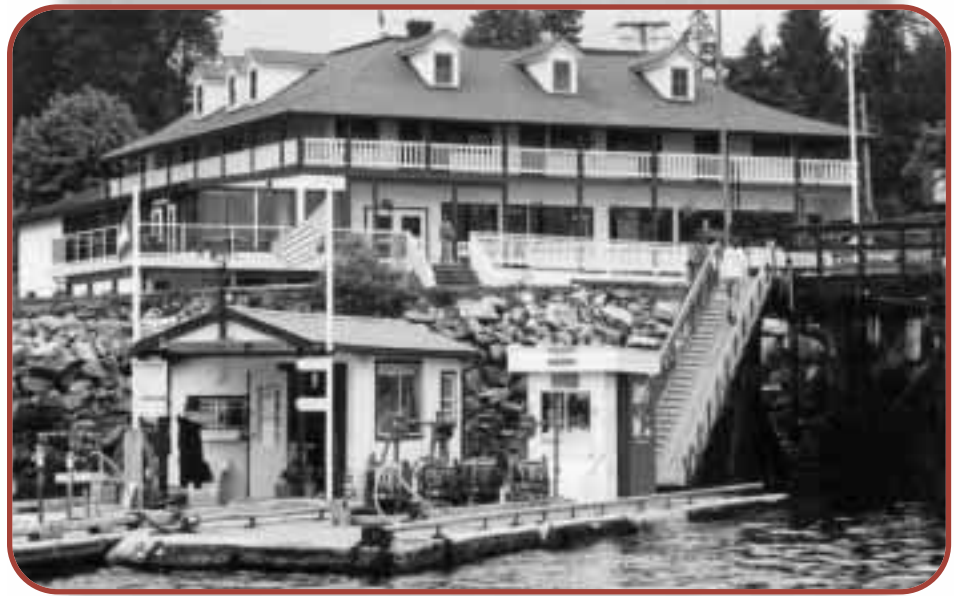
View of the Lund Hotel from the water.