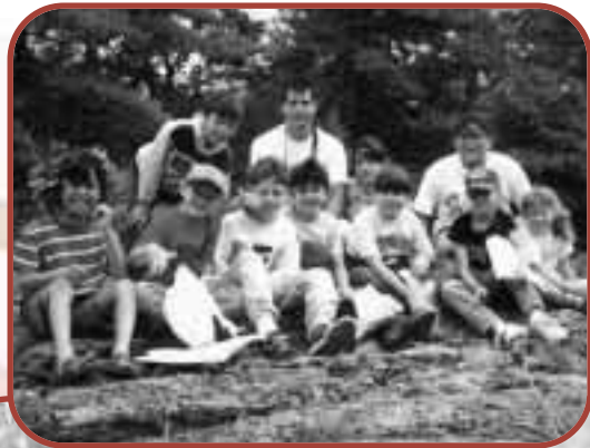
Moose Deer Point First Nation youth.

The Niigon Technologies plant will supplement its power requirements through on-site fuel cells and solar panels.