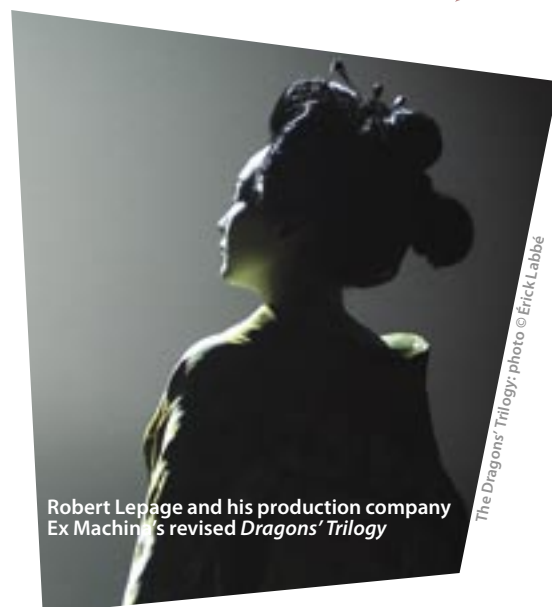
Robert Lepage and his production company Ex Machina's revised Dragons' Trilogy

The registration fee is 25 euro (including accommodation and