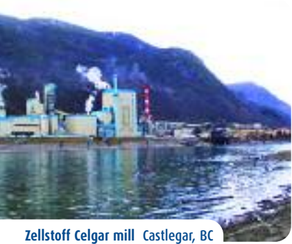
Zellstoff Celgar mill Castlegar, BC

CRIEMP conducted a comprehensive environmental study of the lower Columbia River between Hugh Keenleyside Dam and the US Border between 1991 and 1993, and released its results to the public in 1994. The 1994 CRIEMP report identified activities that had an impact on the environmental health of the Lower Columbia River. Since then, the major industries and hydroelectric operators including Teck Cominco, Zellstoff Celgar, BC Hydro, and Columbia Power Corporation (CPC) have made significant operational changes to address these issues. These initiatives have resulted in significant and measurable improvements to overall environmental quality in the Lower Columbia River.