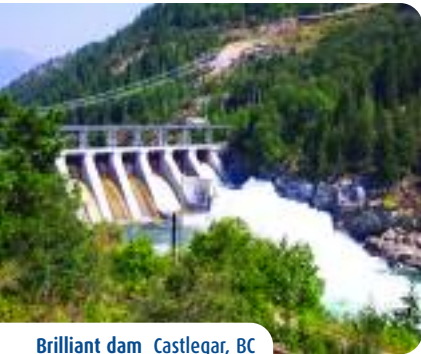
Brilliant dam Castlegar, BC