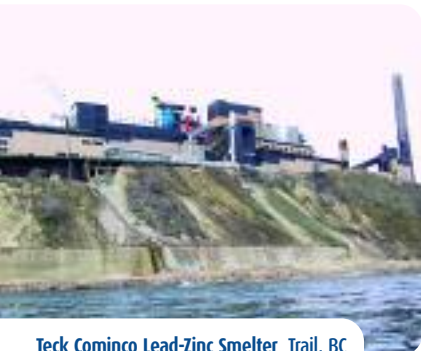
Teck Cominco Lead-Zinc Smelter Trail, BC

Dam operations have changed to further protect fish by reducing potentially harmful levels of dissolved gas in the river downstream ( for details see page 6 ). BC Hydro implemented operational changes that reduced historical gas levels significantly. Upgrades and new facilities at the three major dams – Hugh Keenleyside, Waneta and Brilliant – are designed to increase power generation and to further reduce dissolved gas levels. In addition, BC Hydro manages flows to protect spawning fish and their eggs, in winter for mountain whitefish and in spring for rainbow trout. BC Hydro, in consultation with government agencies, has also developed a protocol to minimize fish stranding associated with fluctuating water levels.