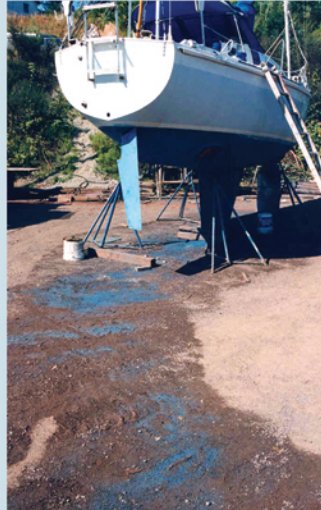
Paint chips and residue not properly contained may flow into fish bearing waters, resulting in a violation of the Fisheries Act .

Ask your boatyard and contractors what they do to prevent pollution from hull maintenance waste.