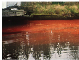
Lack of proper containment during antifouling paint removal can result in deleterious substances being released into the aquatic environment.