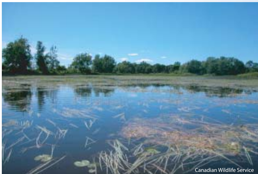
Canadian Wildlife Service

The Agreement includes an overarching agreement to stand in perpetuity, along with four annexes, each of which specifies five-year goals for the Great Lakes Basin Ecosystem. The Lakewide Management Annex includes a commitment for Canada and Ontario to "implement the Great Lakes Wetlands Conservation Action Plan". GLWCAP Phase Two will follow the lifespan of this COA Annex – beginning in 2002 and wrapping up in 2007.