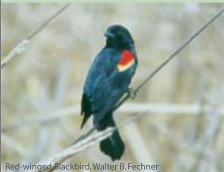
Red-winged Blackbird, Walter B. Fechner

A complete list of the GLWCAP Phase Two milestones is found in the GLWCAP Highlights Report (2000-2003), available on request (see below).