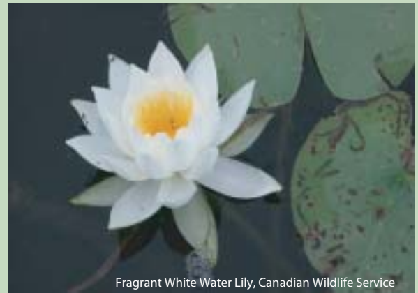
Fragrant White Water Lily

In 2000, the first Action Plan wrapped up while planning for a second Action Plan began. Development of GLWCAP Phase Two involved evaluating the previous Action Plan to assess progress towards the completion of each milestone (see GLWCAP Highlights Report (1997-2000)). The relevance of each milestone in today's wetland conservation environment was also considered, given changes in policy and scientific understanding since the writing of the first GLWCAP work plan. Phase Two does not present new strategies, as there will always be work to be done to further wetland conservation under these broad areas. It does present new and modified milestones to guide continued progress under each strategy.