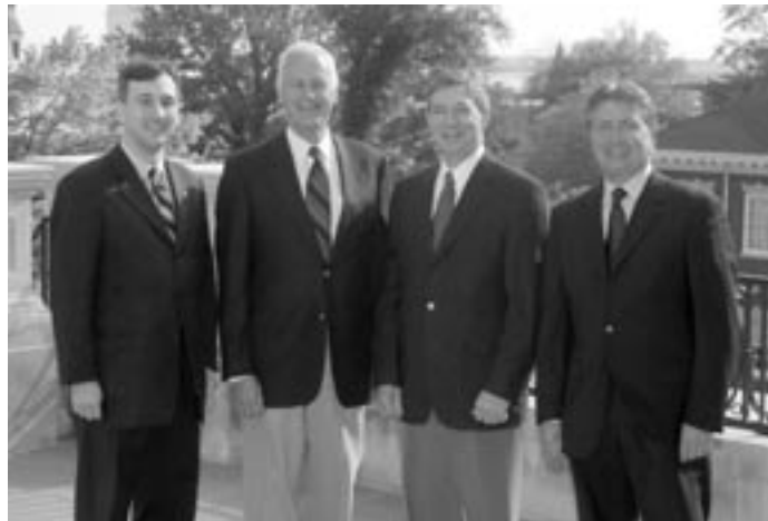
Premier Bernard Lord, New Brunswick

Our accomplishments over the last four years have helped strengthen the working relationships among Canada's Atlantic provinces and we are confident that Building on Progress will position the region well for the future.