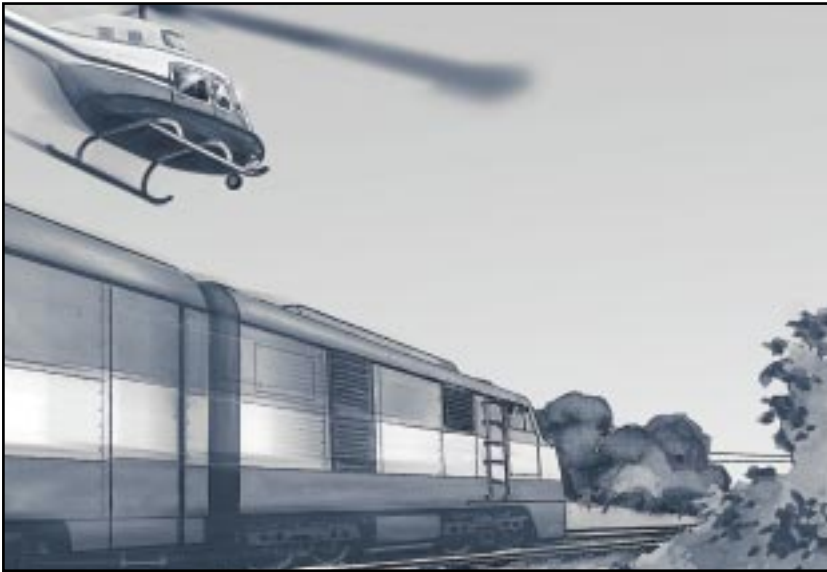
Artist's impression of moment before the wire strike

On February 26, 1999, the pilot and a two-person film crew were conducting an aerial photographic flight to film train traffic in the area near Hinton, Alberta. As a train approached Entrance, Alberta, about five miles west of Hinton, the pilot manoeuvred the helicopter over the train cars. Once directly over the cars and about 40 cars behind the locomotives, the pilot descended the helicopter to a skid height of about 12 ft above the rolling stock and adjusted his flight speed so that he was slowly overtaking the locomotives. About 30 seconds into the film run, the helicopter struck two steel electrical wire conductors that crossed the rail line at a 90° angle. The wires contacted the helicopter just above the windshield and moved aft into the pitch control rods and main rotor mast. The pitch control rods were severed and aircraft control was lost. The aircraft pitched up, yawed left, then right, and descended in a 45° nose-down attitude, striking the ground about 90 ft left of the passing train and about 600 ft beyond the point where the wire strike occurred. All occupants of the aircraft were wearing both lap and